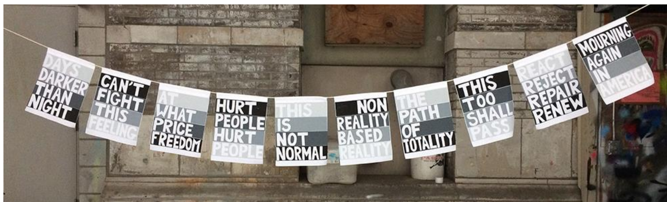
Lisa Anne Auerbach. Ten Truths Self Evident , 2018. Ten relief prints from Shina plywood on bleached muslin strung with cotton cord. Each sheet: 9 x 12 inches; total dimensions variable. Printed and published by Island Press, St. Louis, MO. Edition: 20.

ABOUT THE NEW PRINTS PROGRAM: This exhibition is the fifty-ninth presentation of IPCNY's New Prints Program, a platform for artists from a wide range of backgrounds working in the medium of print. The biannual open-call exhibitions feature prints in a variety of formats and techniques produced in the preceding twelve months. Juried by stakeholders in the field, the resulting exhibitions offer snapshots of what artists are contending with in the moment, leading a sense of immediacy to each presentation. The New Prints Artist Development Program supports three exhibiting artists per cycle, offering additional career advancement opportunities: a month-long Artist Residency in partnership with EFA Robert Blackburn Printmaking Workshop; an Artist Mentorship, to provide the artist with critical feedback, career guidance, and introductions in the field; and Sponsored Coursework, which funds workshops or classes of the artist's choice.