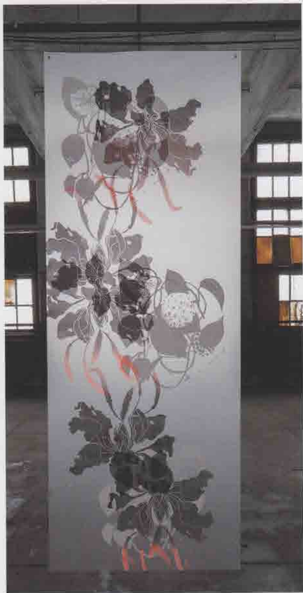
SupraEcology, 2014. Silkscreen on polyester film, 96"x36". L2015.15.1